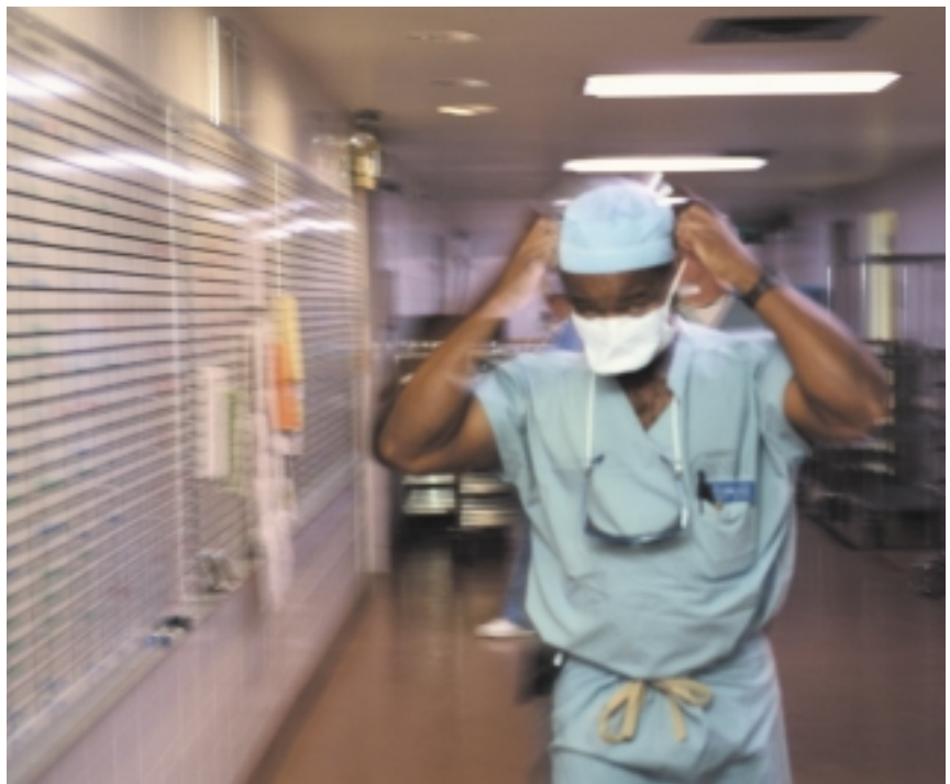
Go with the flow – many workers find themselves happily absorbed in challenging tasks

It has been suggested that traditional management practices effectively treat workers like children who need to be told what to do (e.g. Semler, 1997). Argyris (1957) has long argued that organisations encourage defensive behaviour and that